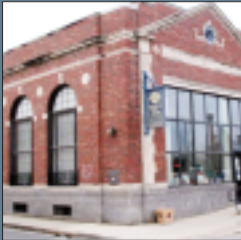
OLNEYVILLE ONE OLNEYVILLE SQUARE 401-421-4084