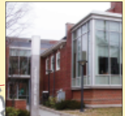
SOUTH PROVIDENCE 441 PRAIRIE AVENUE 401-467-2619