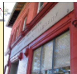
WASHINGTON PARK 1316 BROAD STREET 401-781-3136