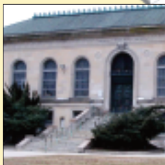
KNIGHT MEMORIAL 275 ELMWOOD AVENUE 401-467-2625