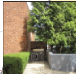
FOX POINT 90 IVES STREET 401-331-0390