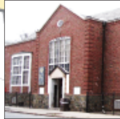
SMITH HILL 31 CANDACE STREET 401-272-4140